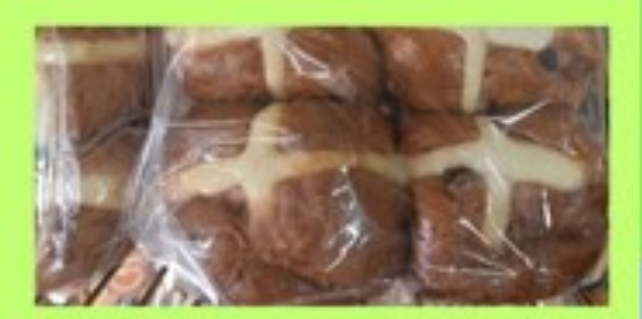
Bakery Hot Cross Buns Weekly $6.90