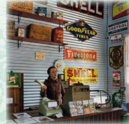
Petrol station / Garage scene