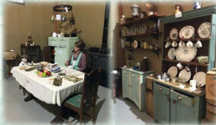
Farm kitchen scene