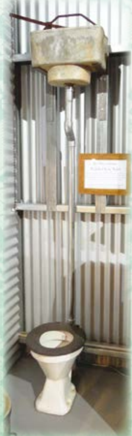
Old pull the chain toilet