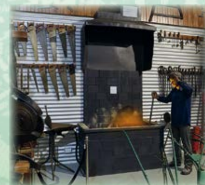
Blacksmith / Farm workshop scene