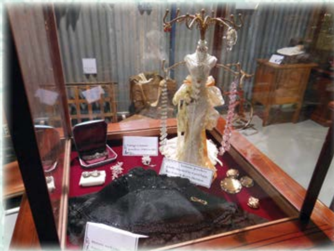
Costume jewellery display

Entry is $3 for adults & $1 for anyone under the age of 18. Please note that nothing larger than a camera or a wallet can be taken into the museum. Lockers are available in the Shire office foyer for secure storage of handbags