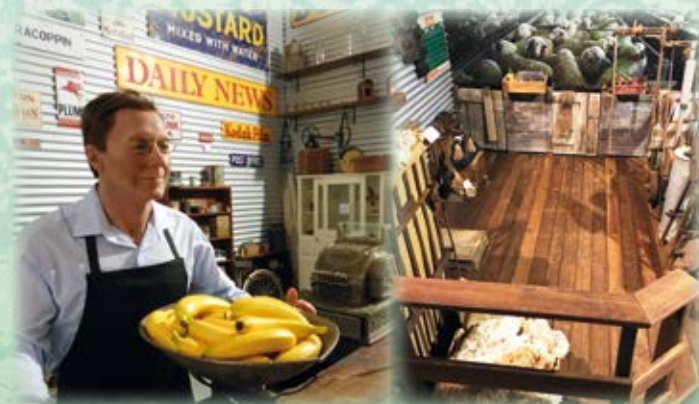
Shop / Hardware store scene