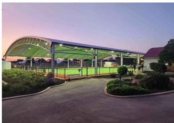
Wanderers Stadium & Bowling Green

Wanderers Stadium and bowling green was completed in late 2008. The bowling green utilises state of the art artificial sports turf. The Sports Stadium boasts a fully air conditioned function room, a barbecue area, shaded deck and fully equipped bar. This community facility is utilised by Westonia's tennis and bowls clubs, as well as other community groups.