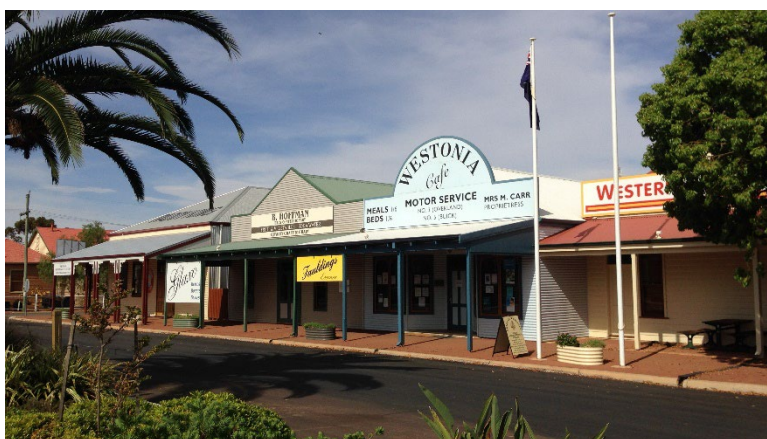
Wolfram Street, Westonia

Down the street, the facades of the town's original bank, café and green grocer store have been recreated. The doors on these facades are real and open to the library and Shire Offices.