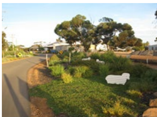
Cement St Streetscape