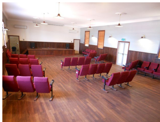
Old Miner's Hall - Westonia