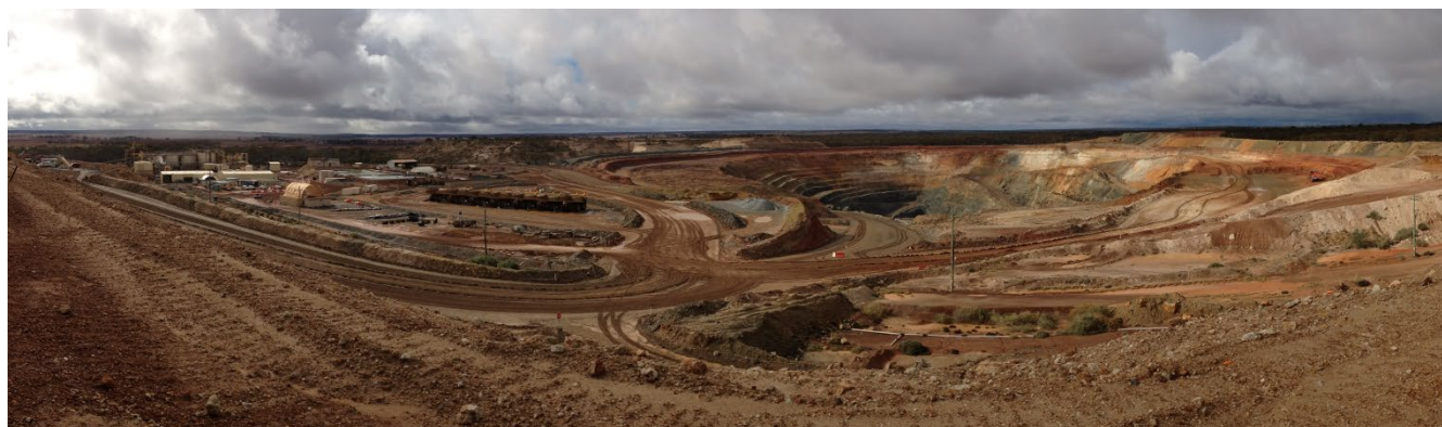
The Edna May Gold Mine – operated by Ramelius Resources

More information is available from Ramelius Resources website at https://www.rameliusresources.com.au/