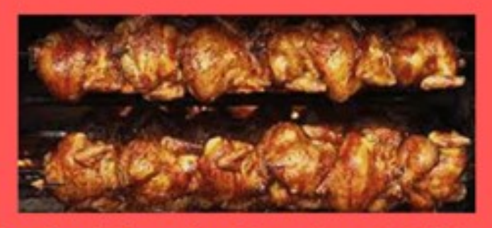
Cooked Chooks Monday & Friday

Opening Hours Mon 8.30am - 5.00pm Tue 8.30am - 5.00pm Wed 8.30am - 6.30pm Thur 8.30am - 5.00pm Fri 8.30am - 5.00pm We have a range of Uggs Sat 8.30am - 12.00pm